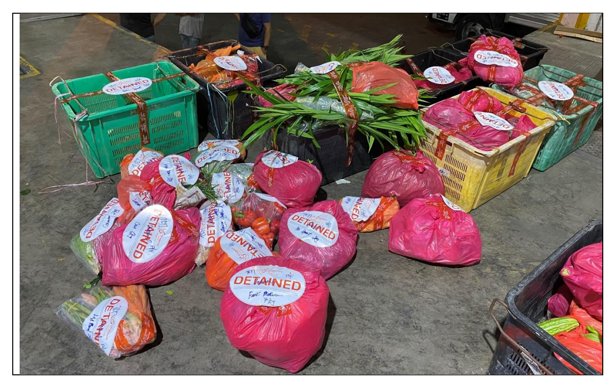
Image 1: Approximately 436.2kg of undeclared and under-declared fresh vegetables were seized by SFA

3 SFA's investigations found that the said company illegally imported approximately 436.2kg of undeclared and under-declared fresh vegetables in the consignments imported from Malaysia. The illegal consignments were seized.