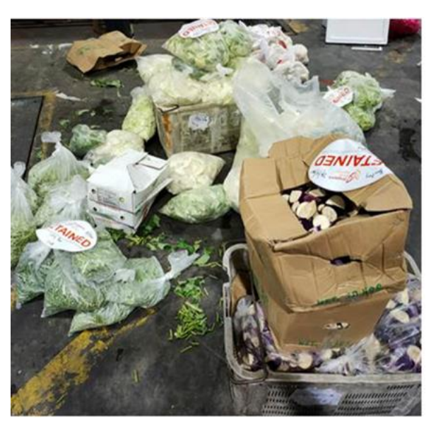
Illegal imports seized from Sunrise Vegetable Pte Ltd