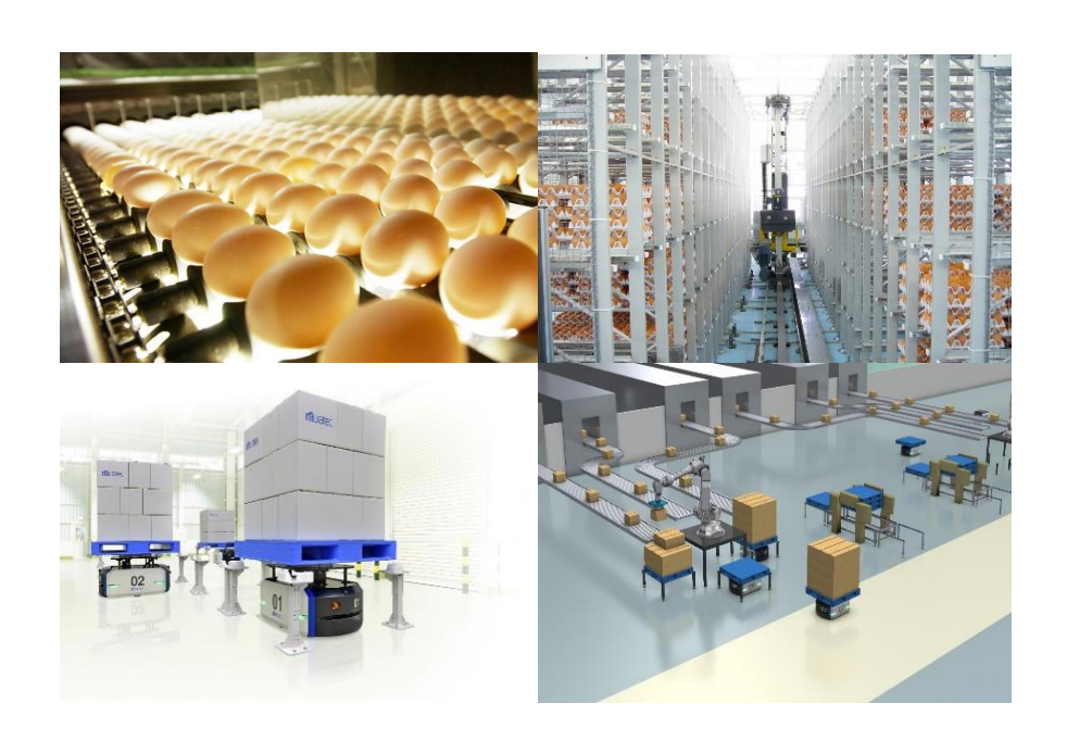
IFH's facilities in Singapore would feature state-of-the-art technologies through the use of Artificial Intelligence (AI) and Internet of Things (IoT).