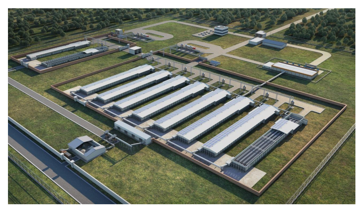
Illustrative visual of the bird's-eye view of IFH's future Egg Layer Farm. (Illustrative visuals: Big Dutchman)