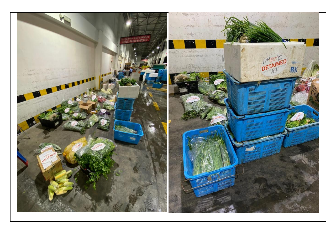
A total of about 378kg of undeclared fresh fruits and vegetables were detected and seized.