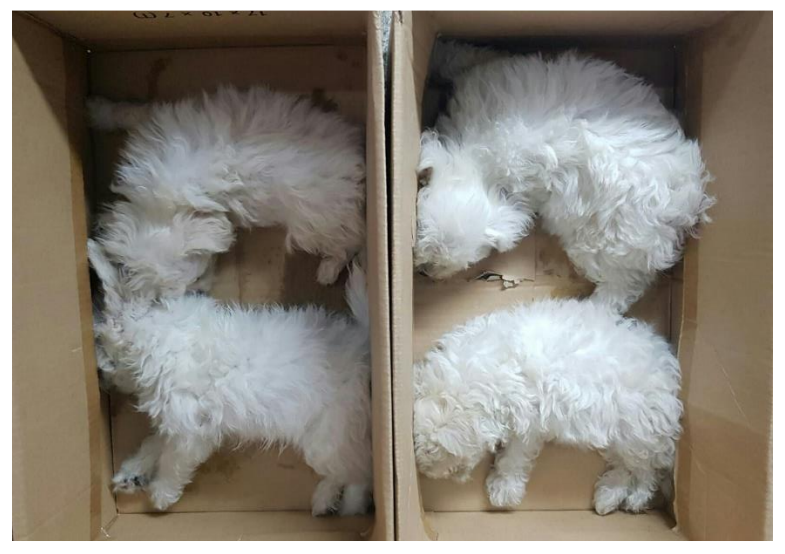
A total of 11 puppies were uncovered from the car