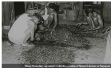
Primary Production Department Collection, courtesy of National Archives of Singapore