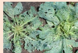
Bites from diamondback moth larvae.