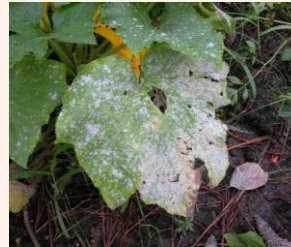
Powdery mildew.