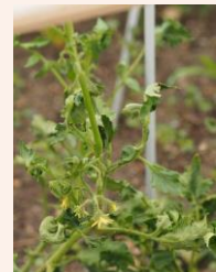
Fusarium wilt on tomatoes.