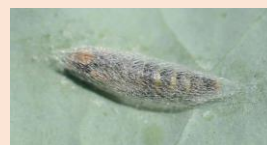
Diamondback moth – pupa.