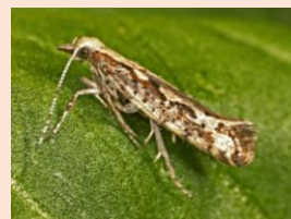
Diamondback moth – adult.