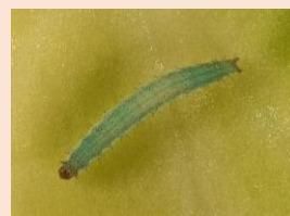
Diamondback moth – larvae.