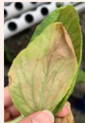
Tiny red dots on underside of leaves indicate spider mites.