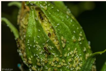
Aphids secrete honeydew that attracts ants.