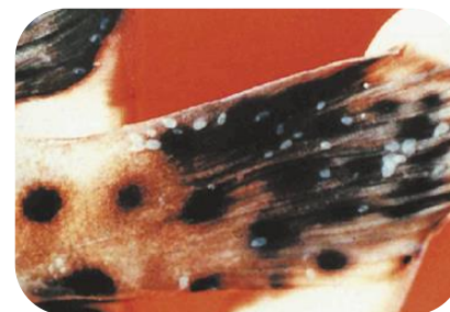
Monogeneans on caudal fin of humpback grouper

Please observe fish daily and carefully Call your Account Manager* if your fish show these signs: