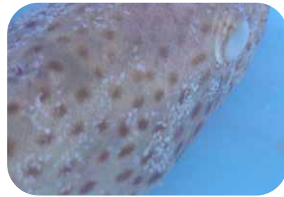
Benedenia sp. on grouper