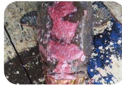
Skin wounds on giant grouper due to monogeneans and secondary infections