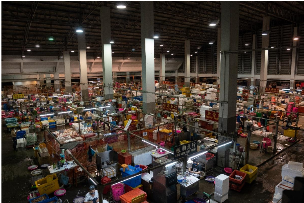
Caption: Entry into the marketplace is restricted, including limits on the number of seafood traders within the premises.