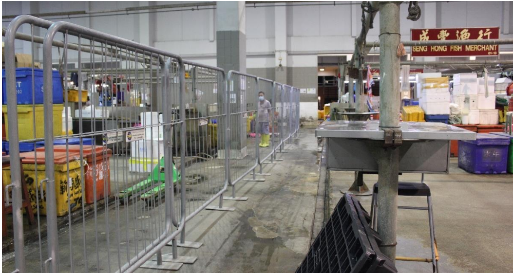
Caption: Fishery port workers based in the marketplace are split into teams, which must not mingle with one another. Marketplace is divided using barriers to prevent intermingling.