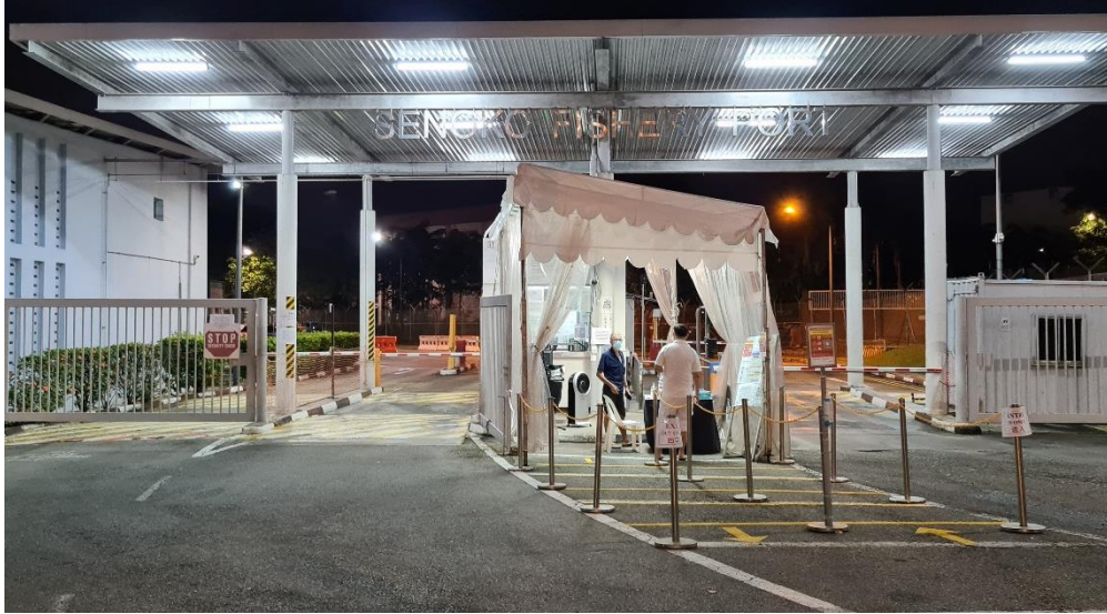
Caption: All authorised entry pass holders are required to undergo testing prior to entry, before they transition to a seven-day Rostered Routine Testing (RRT) regime.