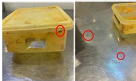
Live cockroaches were observed in the premises

3 In the interest of public health, SFA suspended their food business operations from 18 Nov 2022 to 29 Dec 2022, and directed the licensee to rectify the lapses and take necessary measures to improve the food safety practices and the cleanliness of its premises. SFA also adjusted the food shop's food hygiene grade from "A" to "C".