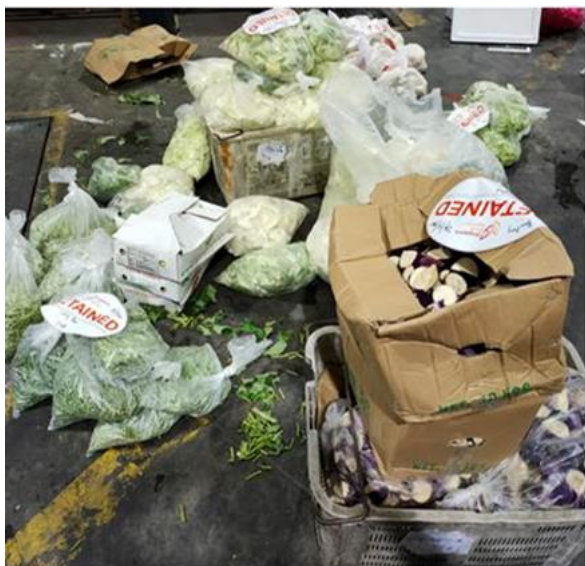
Illegal imports seized from Sunrise Vegetable Pte Ltd

3 SFA's investigation found that Sunrise Vegetable Pte Ltd illegally imported approximately 193kg of processed vegetables and Bao Kang Enterprise illegally imported approximately 407kg of fresh vegetables. These consignments from Malaysia were seized.