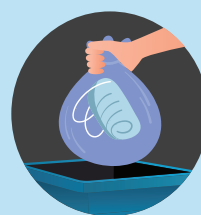
Change disposable mask or wash cloth mask/spit guard regularly