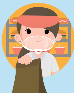
Packing food products