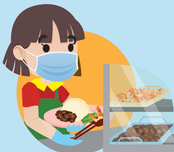
Dishing cooked/ Ready-to-Eat food to consumers