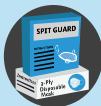
Follow instructions as indicated by manufacturers