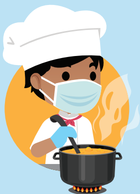
Processing or preparing food and ingredients

When should food handlers wear spit guards or masks?