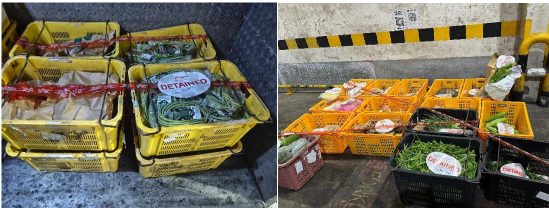
All illegal imports are seized

5 In Singapore, food imports must meet SFA's requirements. Illegally imported produce and food products of unknown sources can pose a food safety risk. Food can only be imported by licensed importers, and every consignment must be declared and accompanied with a valid import permit. Illegally imported food products are of unknown sources and pose a food safety risk.