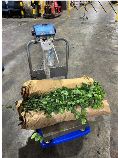
Produce is weighed and the total weight is tallied